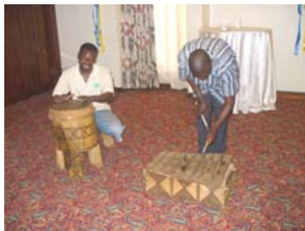
The drummers who set the drums beating at the Laico Recency. African drum rumbled real hard... "wow I can still feel the beat!"