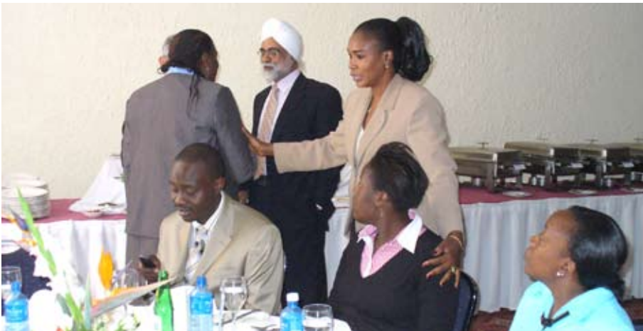
Rotarians and guests get ready for the World Understanding day celebrations to start.

Its current customers include Ten Thousand Villages a Mennonite Church organization from North America that buys handicrafts specifically from disadvantaged groups in the Third World and The Body Shop International.