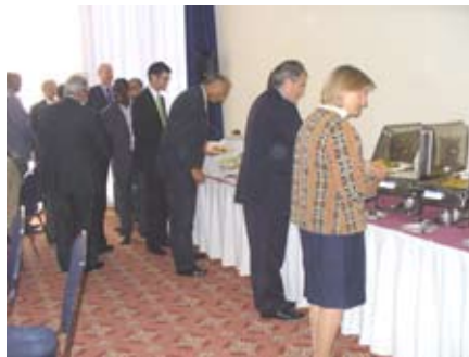
Guests and fellow Rotarians serve lunch at the Hilton, where the WUD was held.